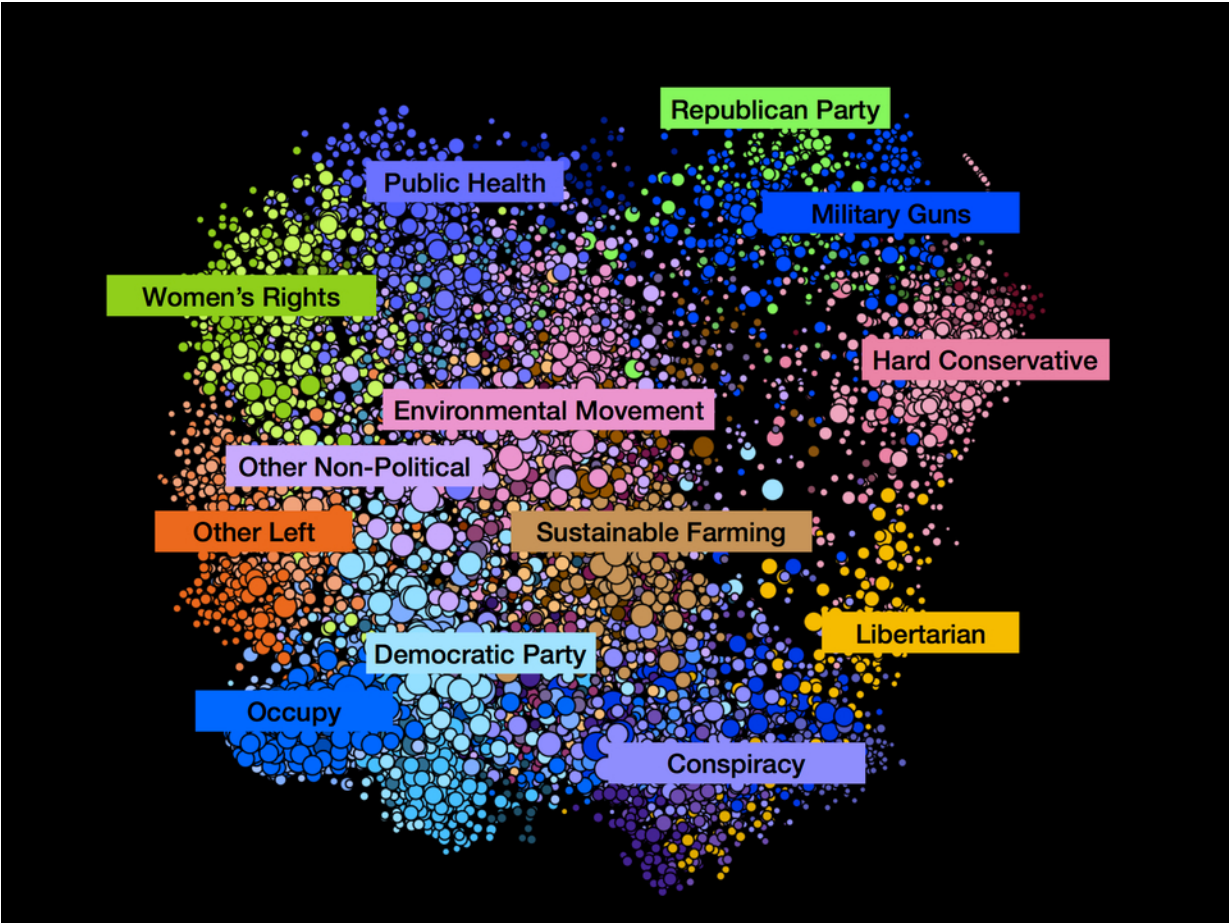
Figure 2: Full Illustration of US Audience Groups on Facebook

Note: Groups are determined through network association and our interpretation of the kinds of content these users distribute.