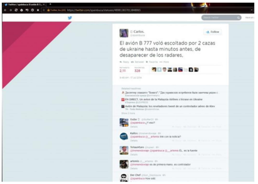
Figure 1: Tweet from Fake @spainbuca Account

This theory was initiated by tweets of an alleged Spanish air traffic controller named Carlos (@spainbuca) working in the Kyiv Boryspil Airport, who claimed to have seen a military aircraft in the area of the catastrophe.