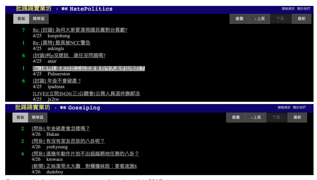
Figure 1: Screenshots of Two Popular Boards on PTT (批踢踢), HatePolitics (黑特) and Gossiping (八卦)