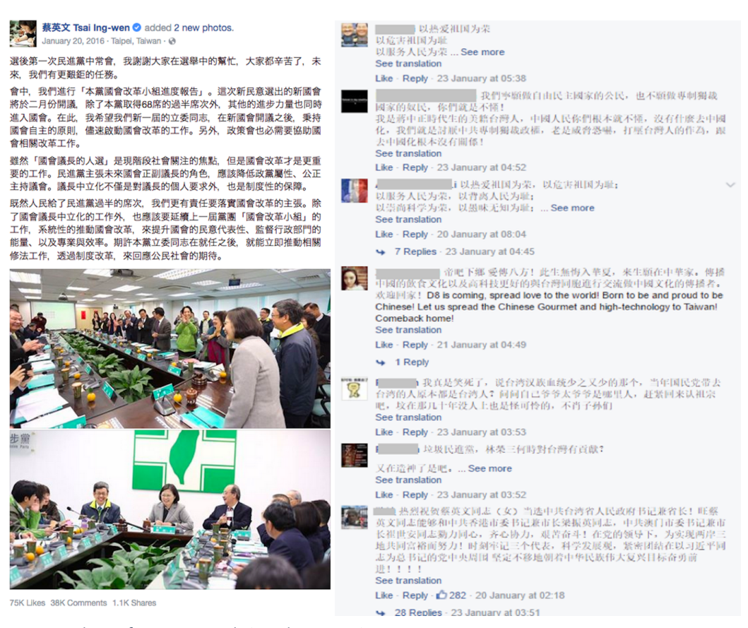
Figure 4: Screenshots of Tsai Ing-wen's First Party Meeting Facebook Post After Being Elected President in 2016.