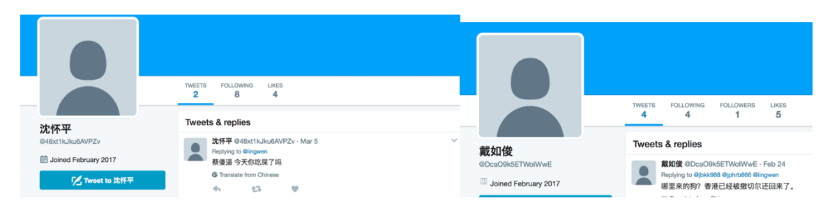
Figure 2: Screenshot of Suspicious Accounts on Twitter