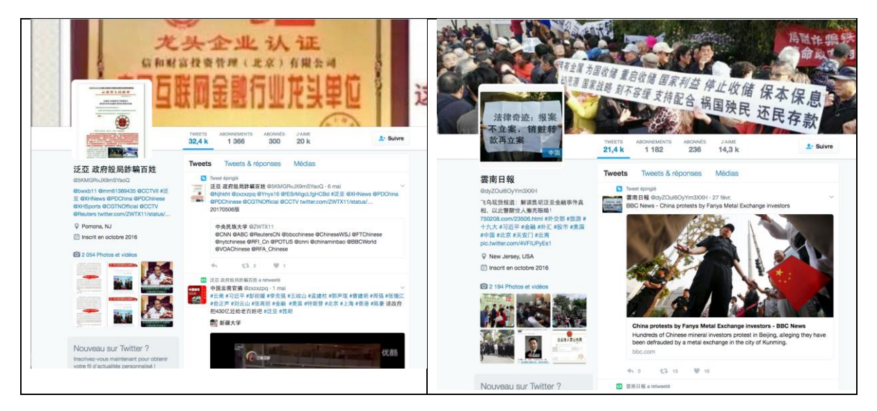
Figure 4: The top four highest-posting accounts in the pan-Asia group

Figure 4 shows the top four highest-posting accounts in this group and demonstrates the similarity between accounts in this group. All four of these accounts have usernames composed of nonsensical strings of characters and numbers. However, three of the accounts have uses names that suggest that they are media organizations. Despite publishing predominantly in simplified Chinese, each of these four accounts lists their location as being in the United States. Each of these accounts has approximately 1,000 friends and 300 followers and appears to post frequently, having posted between 14,000 and 37,000 tweets since their creation in either 2016 or 2017.