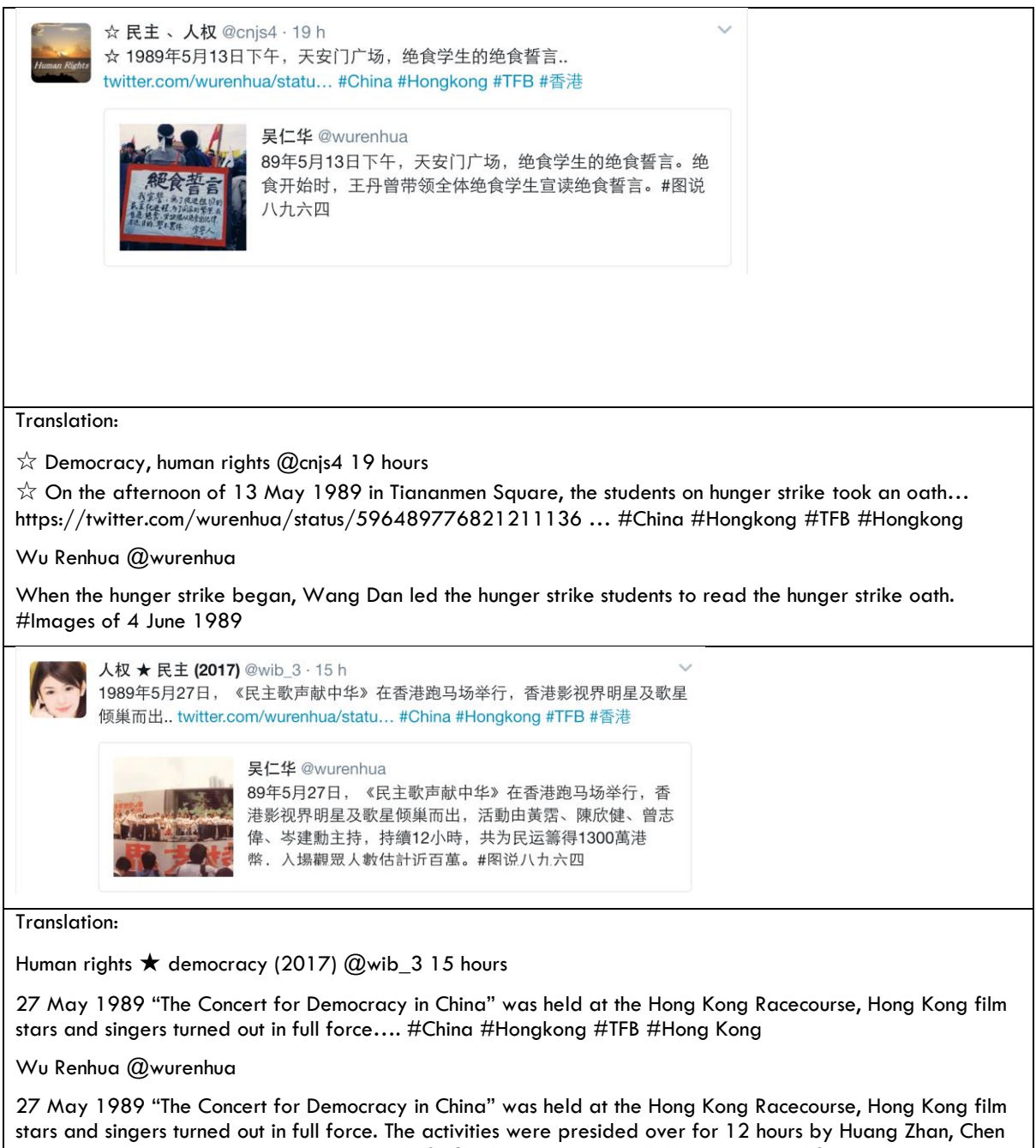
Figure 2: Examples of forwarded posts from the 1989 bot group

Xinjian, Eric Tsang and Cen Jianxun. A total of 13 million Hong Kong dollars was raised for the democracy movement and the number of viewers was estimated to be almost one million #Images of 4 June 1989