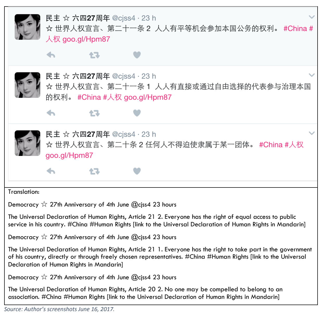
Figure 3: Examples of original posts from the 1989 bot group