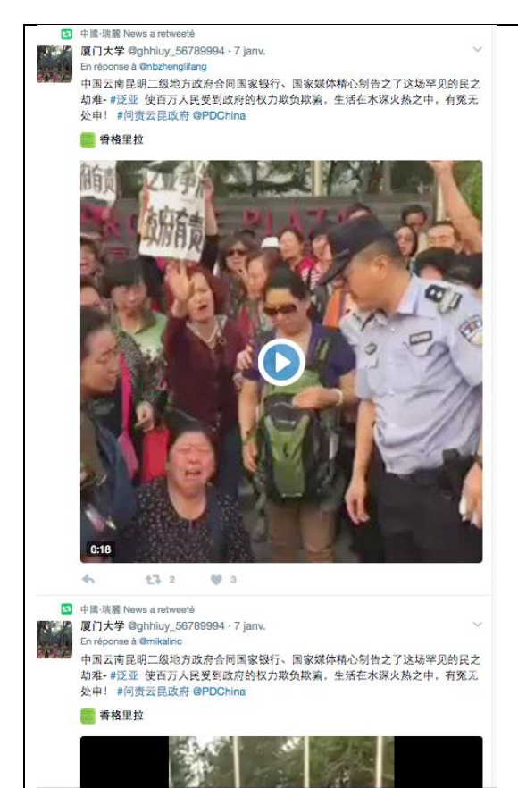
Figure 6: Example of retweeted content in the pan-Asia group