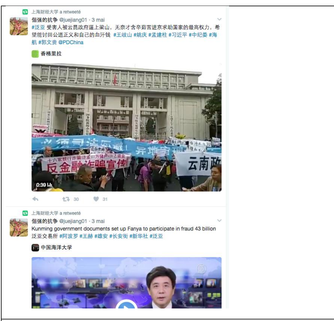
Figure 5: Example of retweeted content in the pan-Asia group