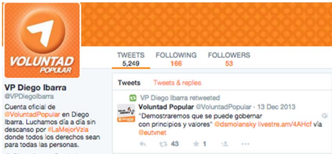
Figure 2: Screenshot of Bot Account @VPDiegolbarra

bot accounts represent themselves not as political candidates, but as VP party branches in different states and cities—they are branches of a party organization. For example, @VP_Carabobo is the account for the state of Carabobo, whereas @VPBejuma is the account for the small town of Bejuma in the state of Carabobo. Figure 2 is a screenshot of the @VPDiegolbarra account page, which is an account that represents the municipality of Diego Ibarra in the state of Carabobo. All of these bots used the Botize platform to retweet content. In addition, most of their usernames had embedded in them the term “VP”—the initials of the Voluntad Popular party.