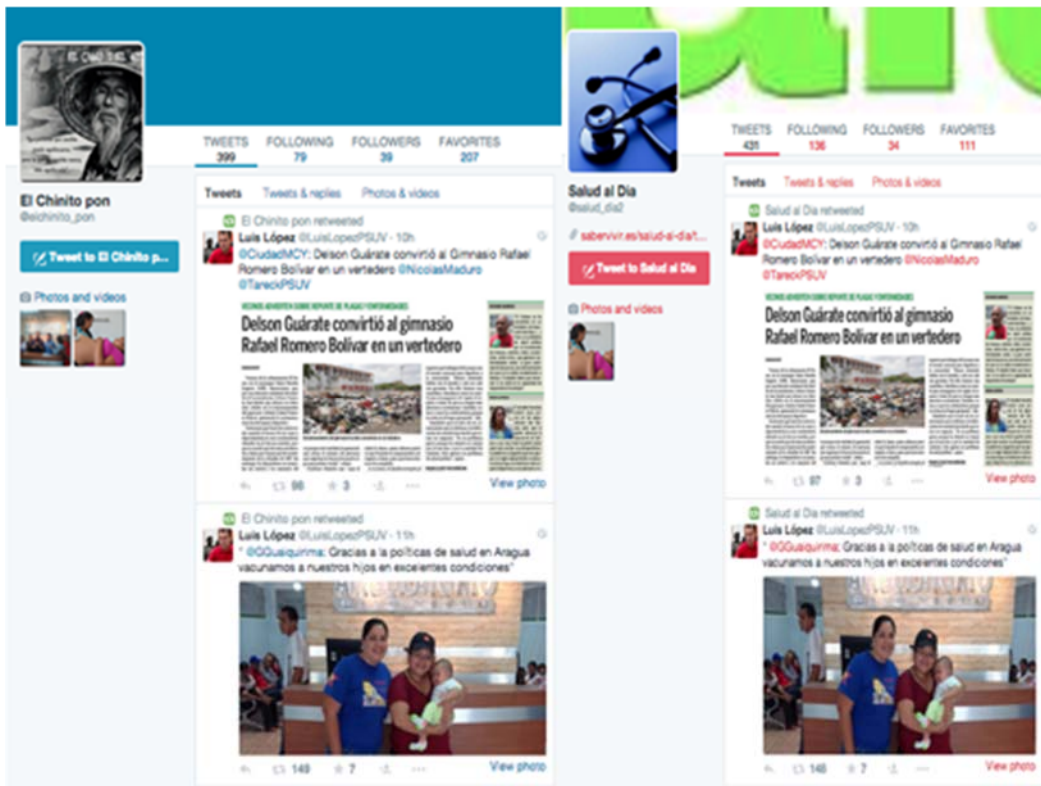
Figure 3: Screenshot of Bot Accounts @salud_dia1 and @elchinito_pon Retweet Incident

produce content and mimic real users. Fake social media accounts now spread pro-governmental messages, beef up web site follower numbers, and cause artificial trends. Bot-generated propaganda and misdirection has become a worldwide political strategy.